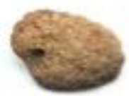
limestone chalk sandstone

SEDIMENTARY These rocks form under the sea. Rocks are broken into small pieces by wind/water (erosion). They settle as mud, sand, minerals and even remains of living things. Over time, layers pile up and the pressure turns this sediment into rock.