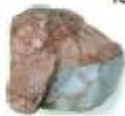
obsidian granite basalt

IGNEOUS Far underground, the temperature is so hot, rock melts into a liquid (molten rock). When the liquid is underground it is called 'magma' and it can cool to form an intrusive rock. When it spills out (volcano), the liquid is called 'lava' and it cools to form extrusive rock.